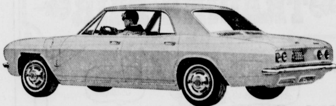
'65 Corvair Monza Sport Sedan

(Some of the things you don't get in a Corvair are among your best reasons for buying it.)