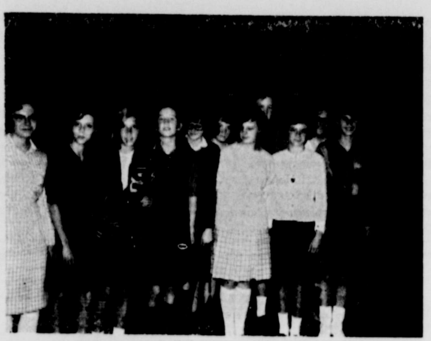
Silver Girls—Consolation Winners