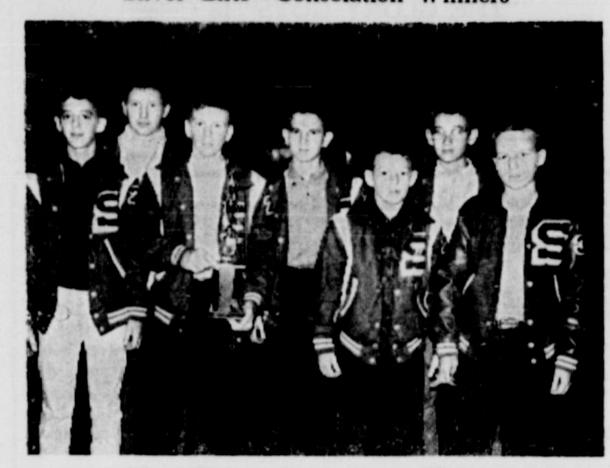
Silver Boys—Consolation Winners