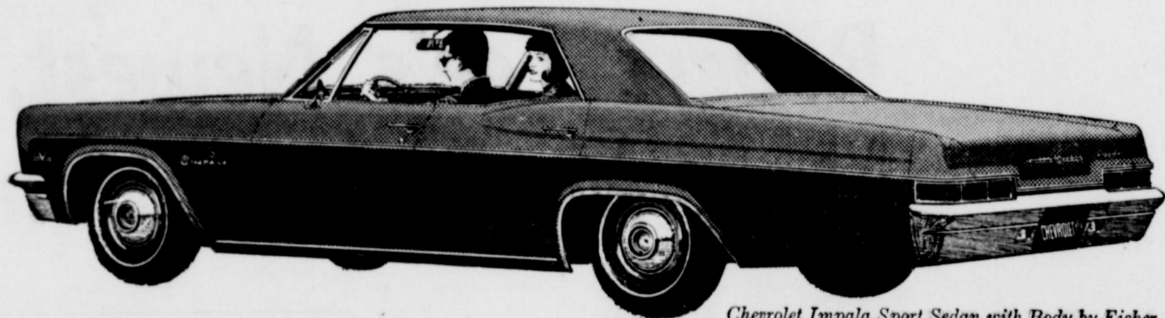
Chevrolet Impala Sport Sedan with Body by Fisher