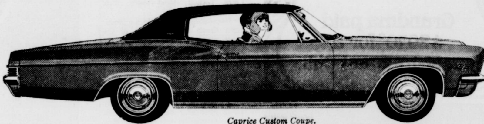
Caprice Custom Coupe.