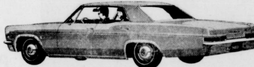
Impala Sport Sedan.