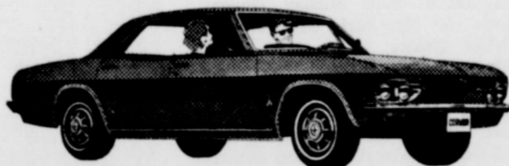
Corvair Monza Sport Sedan.