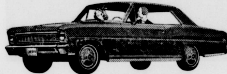
Chevy II Nova SS Coupe.

Starting now—Double Dividend Days at your Chevrolet dealer's! (Just the car you want—just the buy you want.)