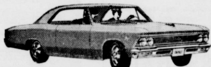
Chevelle SS 396.