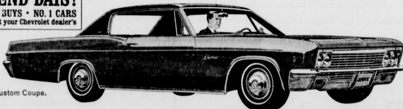
'66 Caprice Custom Coupe.

All kinds of good buys all in one place... at your Chevrolet dealer's: Chevrolet • Chevelle • Chevy II • Corvair • Corvette