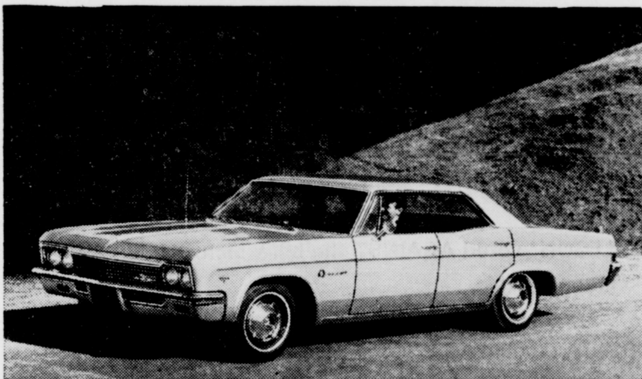
1966 Impala Sport Sedan—a more powerful, more beautiful car at a most pleasing price.

If you haven't examined a new Chevrolet since Telstar II, the twist or electric toothbrushes,