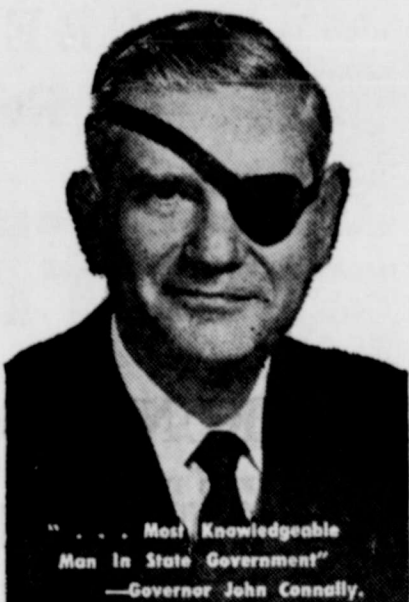
Most Knowledgeable Man In State Government — Governor John Connally.

One man stands tall as THE qualified candidate in the Attorney General's race. He is so obviously the best choice that more than 75 newspapers have endorsed him over two young opponents.