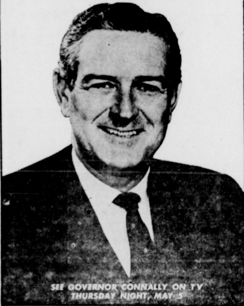
SEE GOVERNOR CONNALLY ON TV THURSDAY NIGHT, MAY 5

I am deeply grateful for your continued confidence. I hope that I may merit your support again on May 7th-- both at the polls and at your precinct convention, to continue the important progress we are making together.