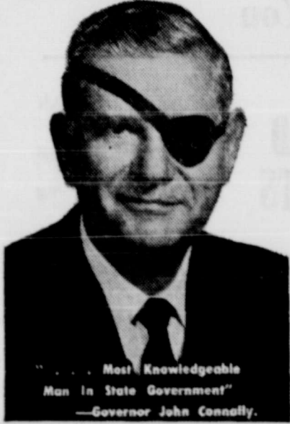
Most Knowledgeable Man in State Government —Governor John Connally.

WARNING! LIBERALS SEEK UPSET ON JUNE 4TH!