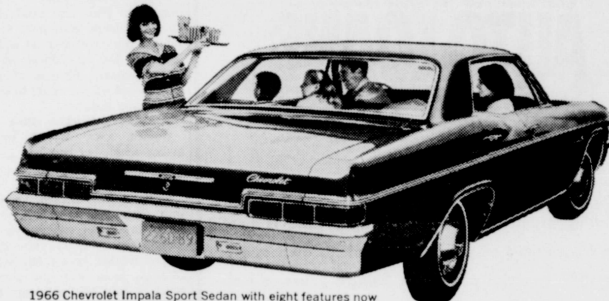
1966 Chevrolet Impala Sport Sedan with eight features now standard for your added safety—including back-up lights and seat belts front and rear (always buckle up!).

What you get is • The meticulous coachwork of Body by Fisher that surrounds you with rich appointments, deep-twist carpeting • Full Coil suspension that uncrinkles roads • Magic-Mirror finish • Gobs of room for hips, legs and feet.