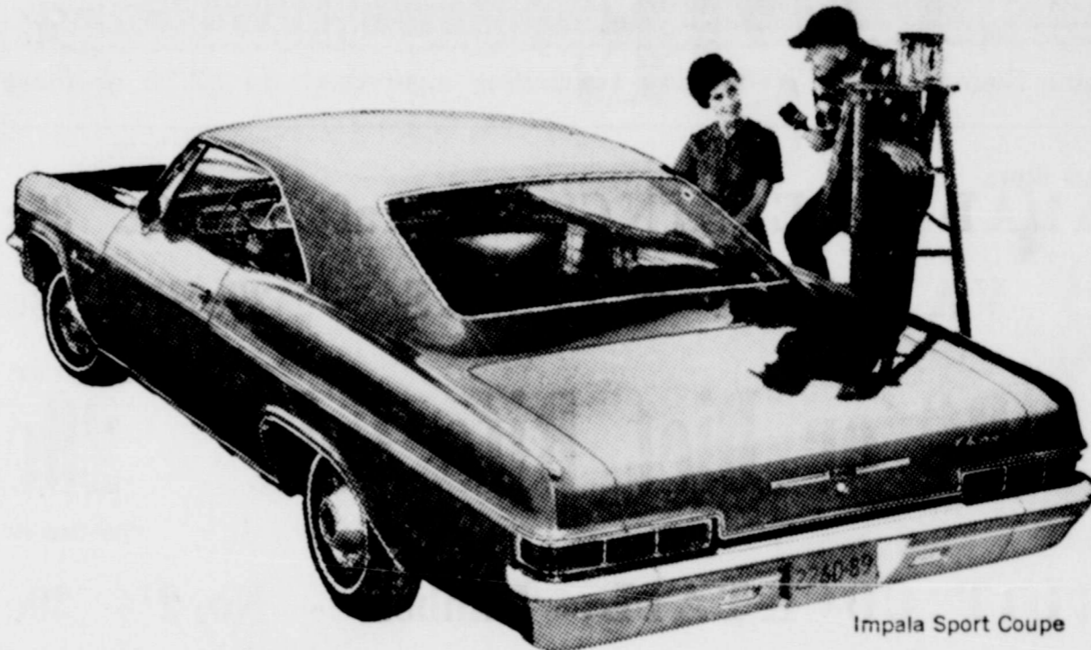
Impala Sport Coupe

First decorate your driveway with a new Chevrolet!