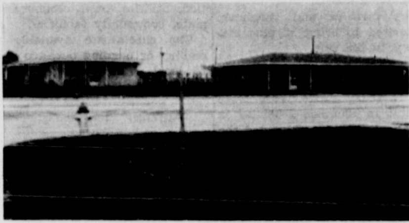
Exterior View of Units