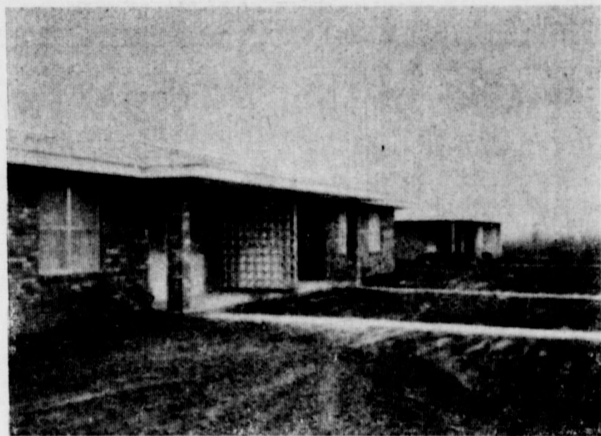
Exterior View of Units

Members of Robert Lee Housing Authority extend a cordial invitation to everyone in the area to come by Sunday afternoon and inspect the new units in Robert Lee's low rent housing project. We are proud of these new houses and feel that you will be, too, when you see how nice they are. Be sure to come by and take a tour of them.