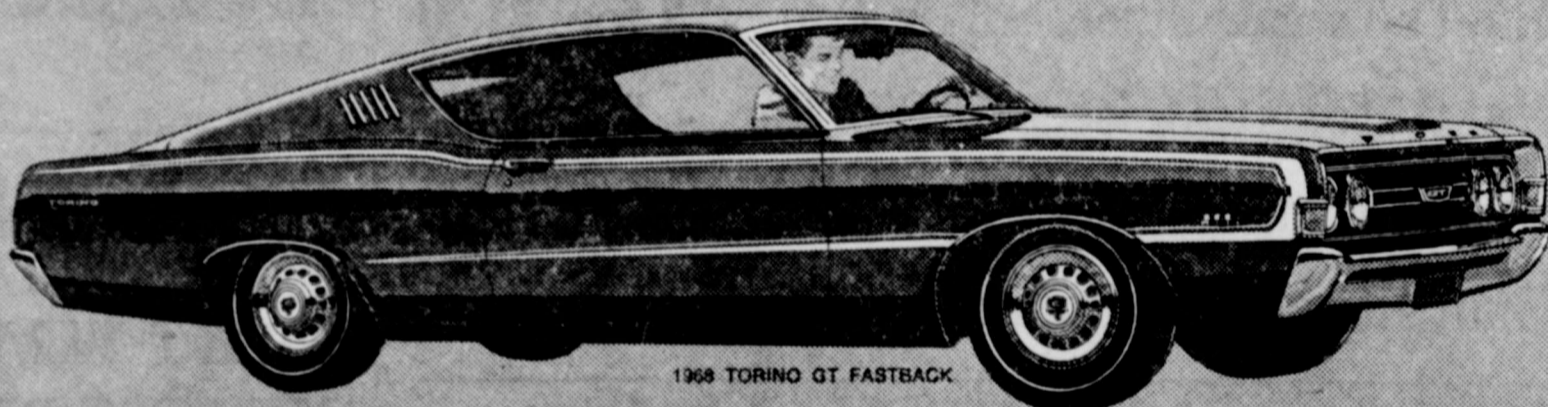
1968 TORINO GT FASTBACK

Any way you measure it, that adds up to more value.