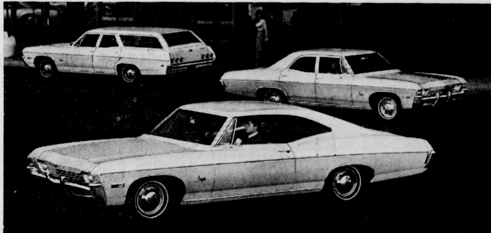
Impala Sport Coupe (foreground), 4-Door Sedan, Station Wagon

is proud to have a part in helping the Robert Lee Area of the new lake grow. Serving in the lake vicinity, the cooperative will be glad to help in any way to secure their needs in the electrical service to cabins or commercial establishments.