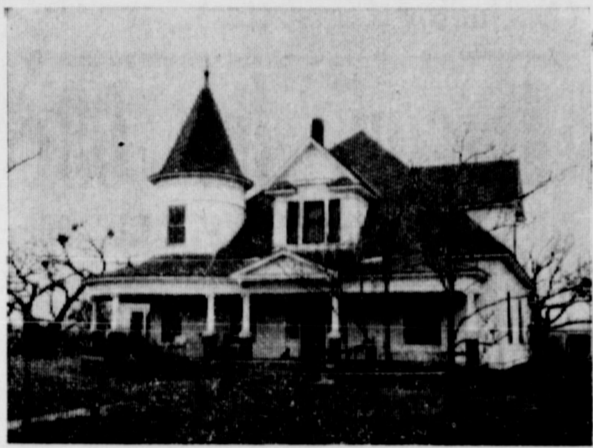
The Saul Ranch House