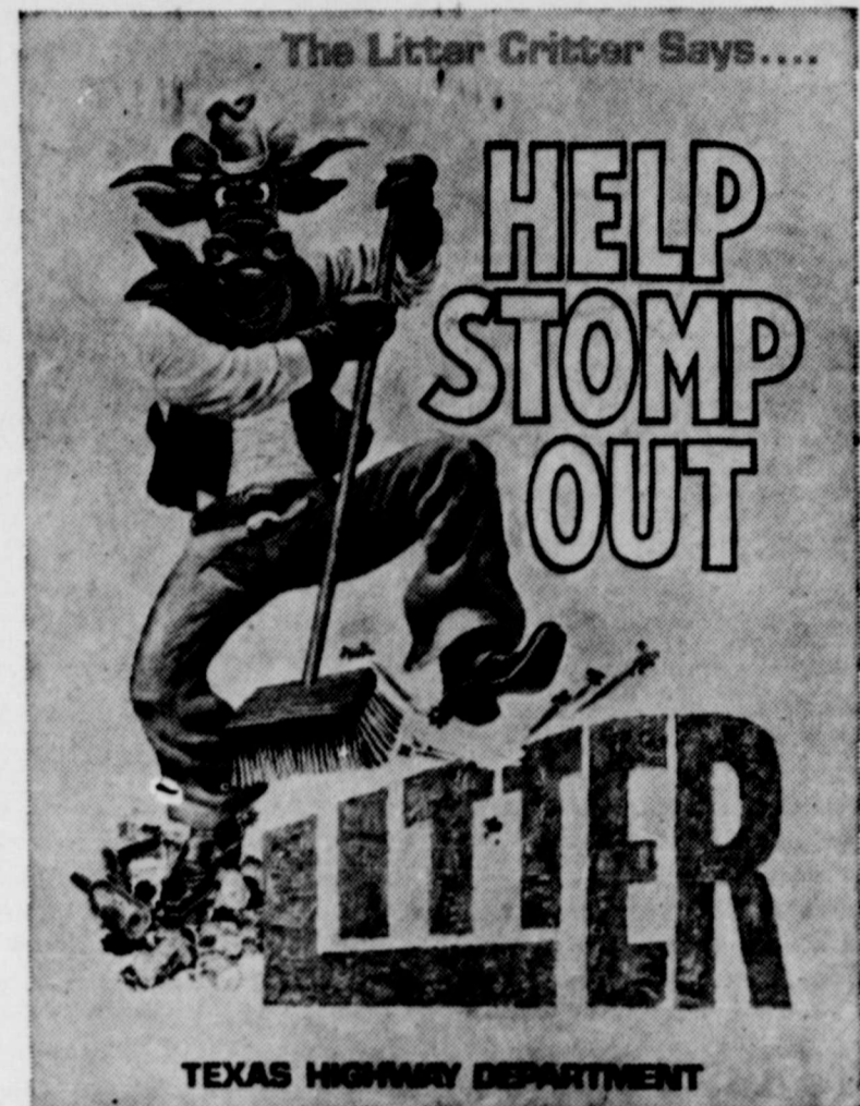
BITTER CRITTER — The Litter Critter, the Texas Highway Department's faithful sidekick in the battle against highway litter, now is making his appearance on colorful 17x22-inch posters. Litter pickup costs the Department $2 million a year. Schools, garden clubs and other organizations concerned about litter may obtain the posters from Highway Department District Offices, Tourist Information Bureaus or the Travel and Information Division, Texas Highway Department, Austin (78703).