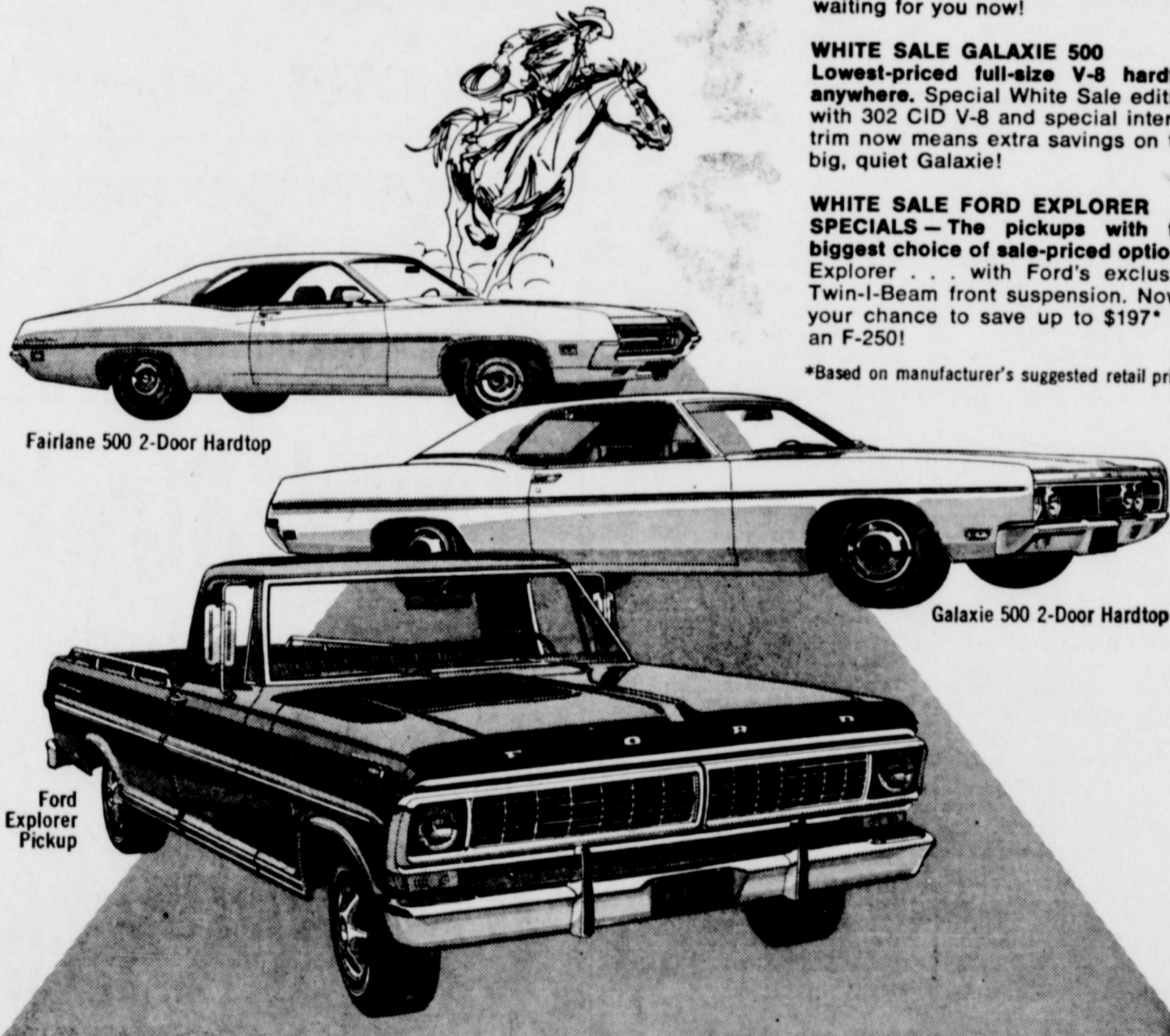
Fairlane 500 2-Door Hardtop

*Based on manufacturer's suggested retail prices