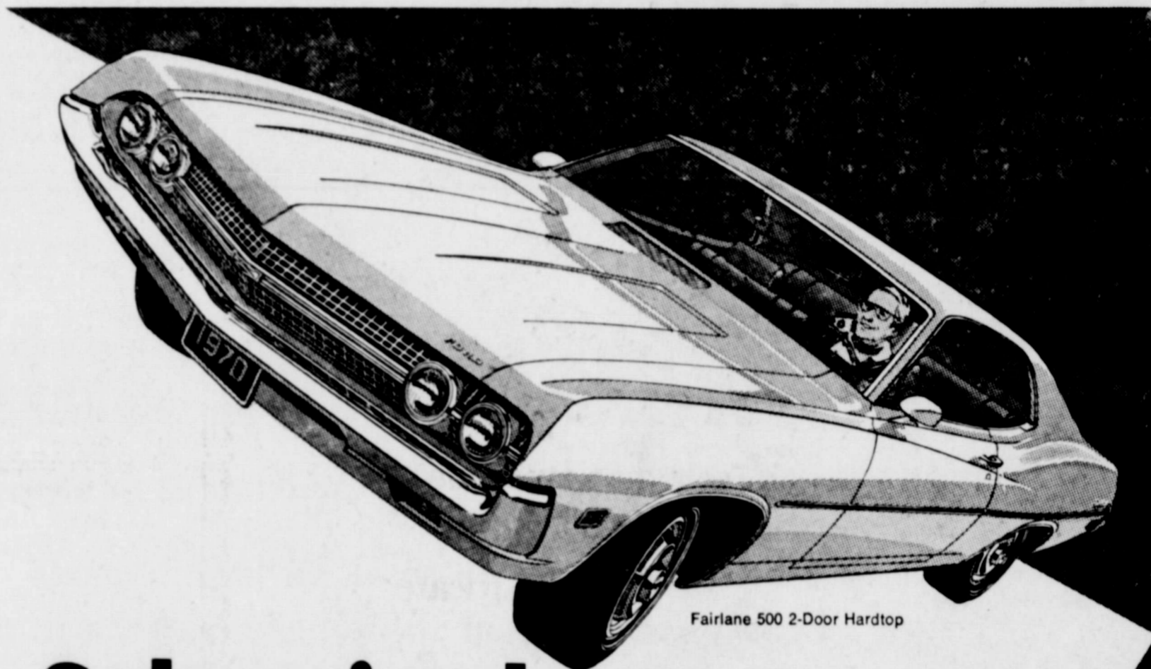
Fairlane 500 2-Door Hardtop

THERE'S HOME TOWN NEWS IN THE HOME TOWN ADS.