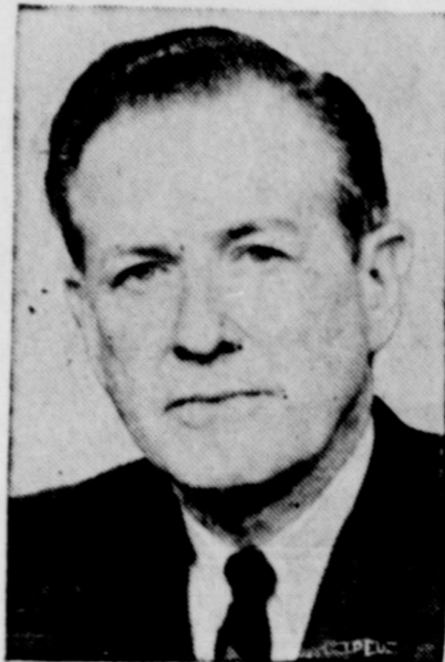
Cong. Omar Burleson

1/2 Beef ..... Lb. 58c German Style Sausage, lb. 83c Ph. 468-3501 Day or Night MILES, TEXAS