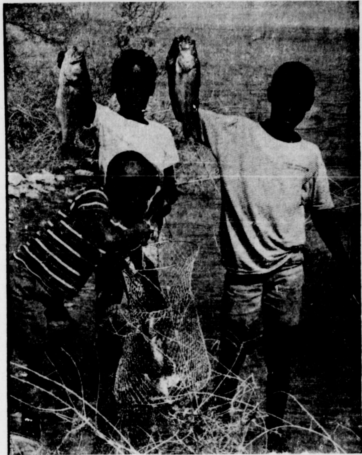
These youngsters did all the good Saturday at Lake Spence