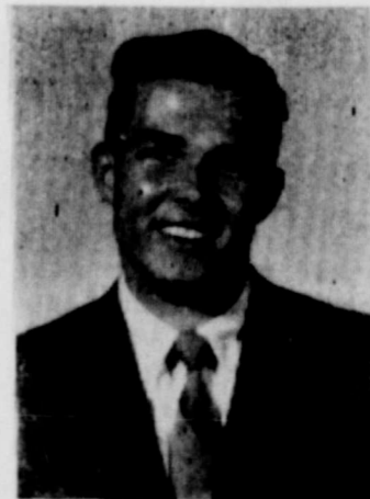
BOBBY LEE Singer