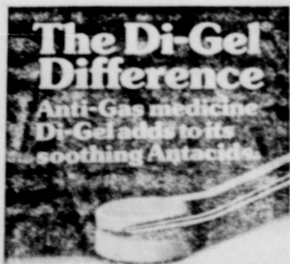
Di-Gel. The Anti-Gas Antacid.