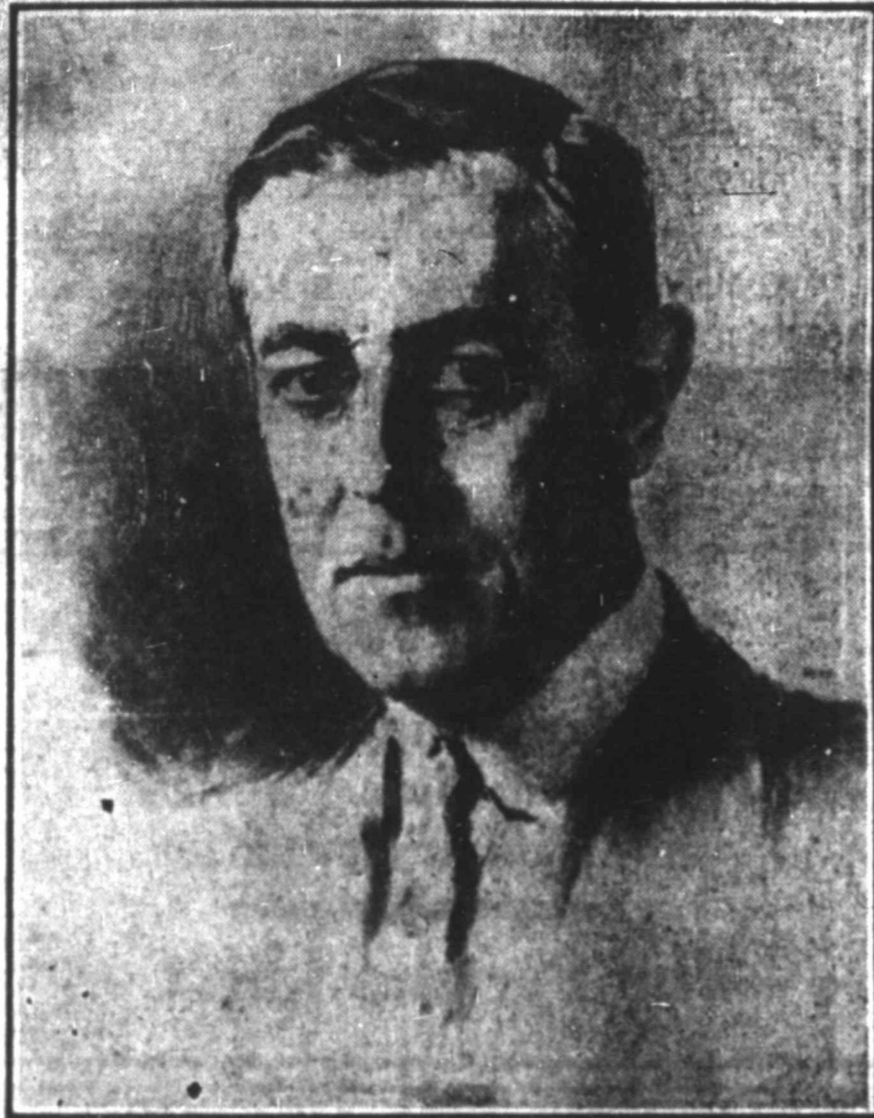
President-Elect Woodrow Wilson of New Jersey

THE JERSEY GOVERNOR MAKES GLEAN SWEEP OF ALL STATES FROM THE ATLANTIC TO THE PACIFIC MOST DECISIVE VICTORY EVER KNOWN IN HISTORY