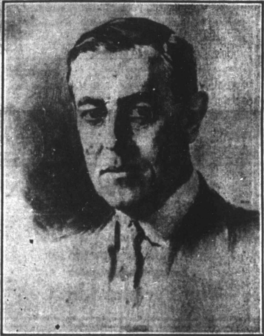
President-Elect Woodrow Wilson of New Jersey

THE JERSEY GOVERNOR MAKES GLEAN SWEEP OF ALL STATES FROM THE ATLANTIC TO THE PACIFIC MOST DECISIVE VICTORY EVER KNOWN IN HISTORY