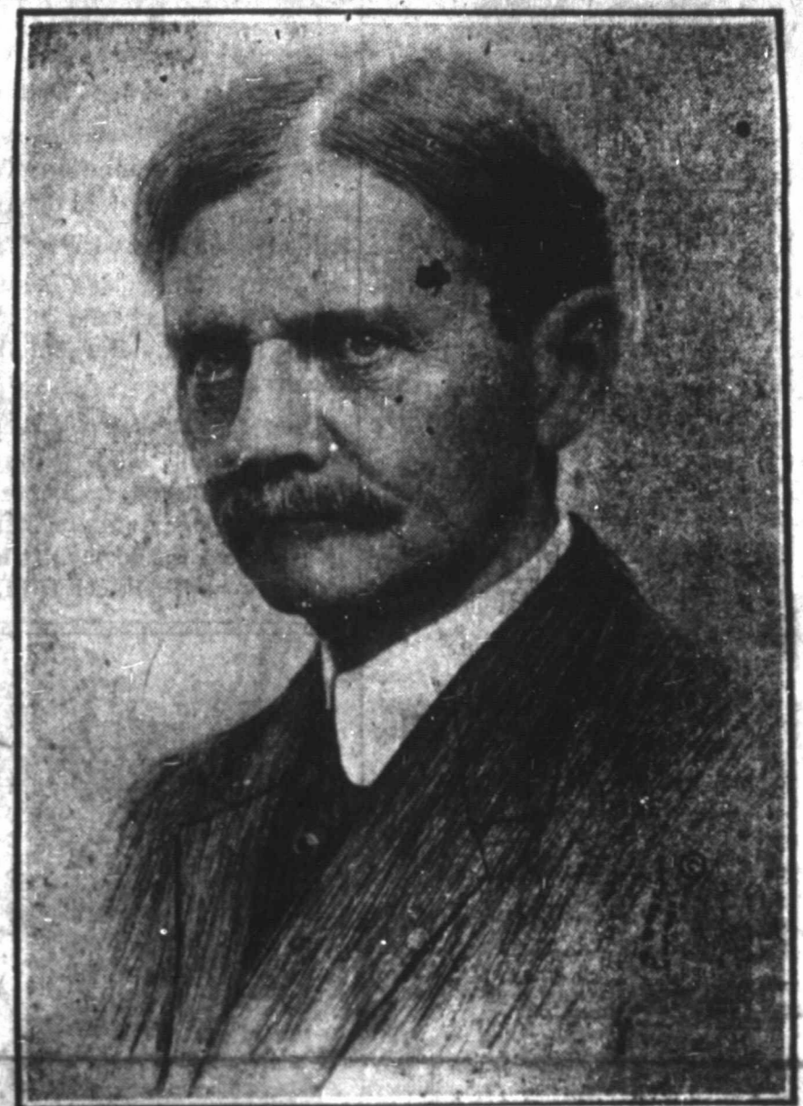
Vice President-Elect Thomas R. Marshall of Indiana