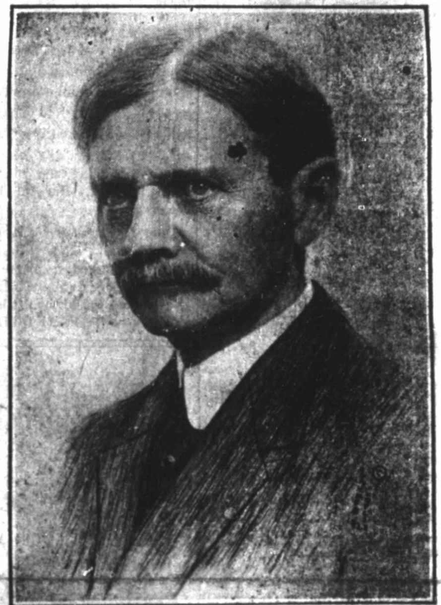
Vice President-Elect Thomas R. Marshall of Indiana