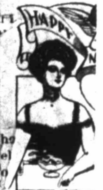
After the N