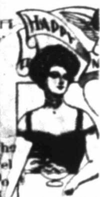
After the N