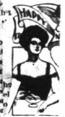
After the N