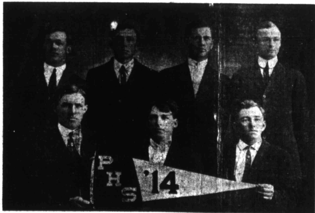
The above is a picture of Portales' high school crack boys basket ball team. This is a manly bunch of young fellows who believe in clean sports and the square deal in everything. The manner in which they played and conducted themselves reflected credit upon themselves and the Portales high school. These young men won every game they played with one exception and it is contended by many that they won this one, but were counted out of it. We are justly proud of our basket ball boys.