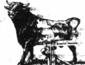
THE AMERICAN TOBACCO CO.

FREE An Illustrated Booklet, showing correct way to "Roll Your Own" Cigarettes, and a package of cigarette papers, will both be mailed, free, to any address in U. S. on request. Address "Bull" Durham, Durham, N. C.