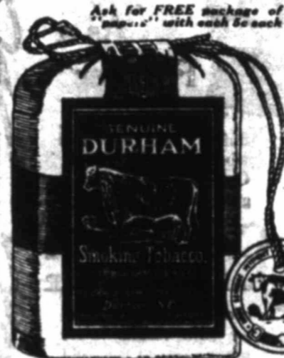
Ask for FREE package of "Bull" Durham with each 10 pack.

You get more wholesome, lasting satisfaction out of "Bull" Durham than from any other tobacco ever rolled up into a cigarette.