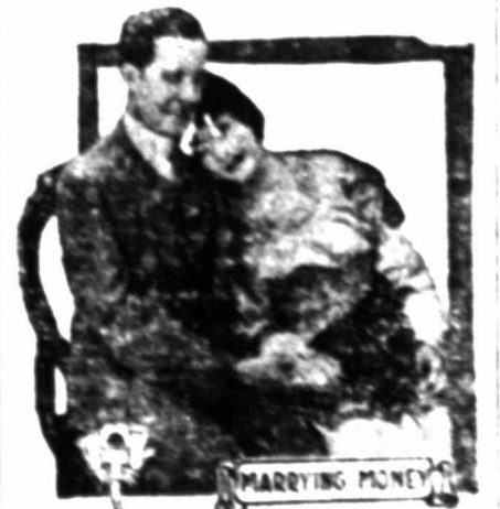
The World Film Corporation presents CLARA KIMBALL YOUNG in "Marrying Money," a Schubert feature in five acts. At Cosy Theatre, Saturday, March 25. Admission 10c and 25c.