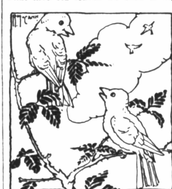
Love," Said Mr. Fox Sparrow.

"What a fine swamp we lived in, and what nice old leaves we used to dig