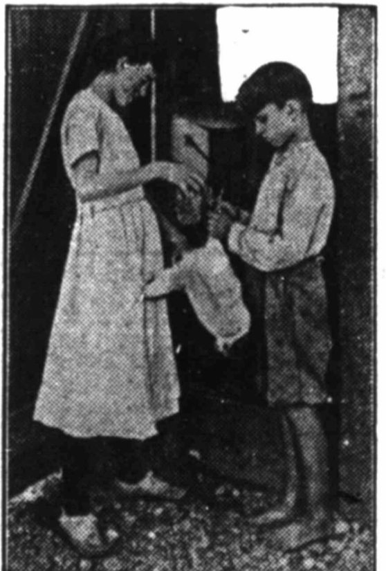
Club Members Dusting a Hen With Insect Powder.

Another plan that has proved to be satisfactory in Overton county, Tenn., is direct financial assistance from the banks. In this case the banks advanced $1,000 to be invested in breeding pens through the co-operation of the poultry club agent and the county agricultural agent. Each pen consisted of ten hens or pullets and a male bird which cost on an average $2.50 a bird. The pens were placed with club members in the various communities. Each person who received a pen guaranteed to return, after the first year, 20 fowls in payment for the original ten hens or pullets furnished him. Those 20 standard-bred fowls, together with two selected male birds, were divided into two pens and the next year