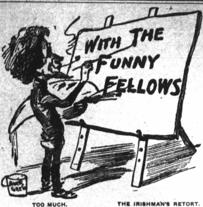
TOO MUCH. THE IRISHMAN'S RETORT.

The shop floor, explains the Prairie Farmer, place the box over it, catch the eyebolt into the hook, place the wheel on top of the box with a board washer and tighten the nut on the eyebolt to hold the wheel while at work, as in fig. 2.