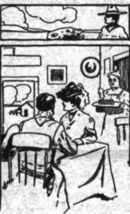
"Where is the Three Bars?"

"Where is the Three Bars?" asked Louise, sinking into a chair at the nearest table, with two other women. One was, that she had seen Helen could have seen along in the wake of this "bold and licentious" man, and comfortably sitting at a cozy little supper for two in a comfortable house; the other thought was to the effect that the invitation was redolent with the promise, and she wondered if not expected to say, "A whiff of home, please."