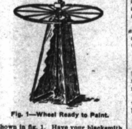
Fig. 1—Wheel Ready to Paint.

Make a box eight or ten inches square at the bottom and six inches square at the top, 2 1/2 to 3 feet tall, as shown in fig. 1.