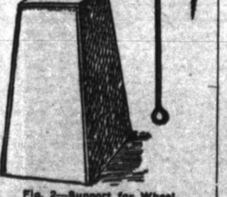
Fig. 2—Support for Wheel.

shown in fig. 1. Have your blacksmith make a screw hook and eyebolt of half-inch iron of a combined length to match the box. Screw the hook into