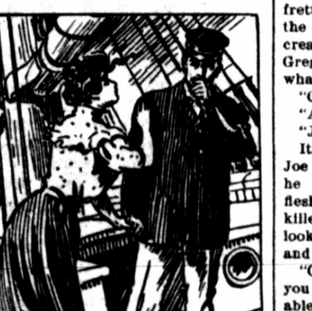
"Get into Your Boat."

He was so weak that she soon got the better of him—so weak and dizzy that he did not guard himself as she struck him on the mouth with her little doubled-up fist.