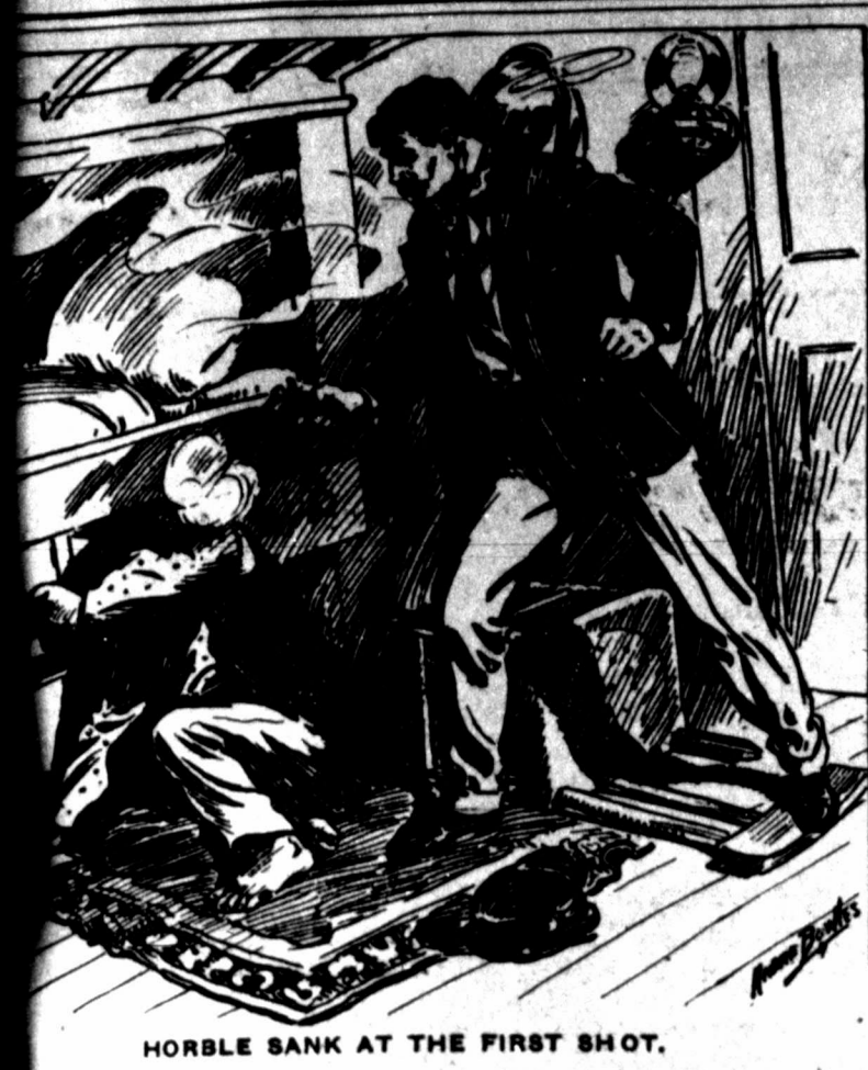
HORBLE SANK AT THE FIRST SHOT.

"The Edelweiss!" he gasped; "the Edelweiss!" "Went down an hour ago, sir," said Cracroft, grimly.