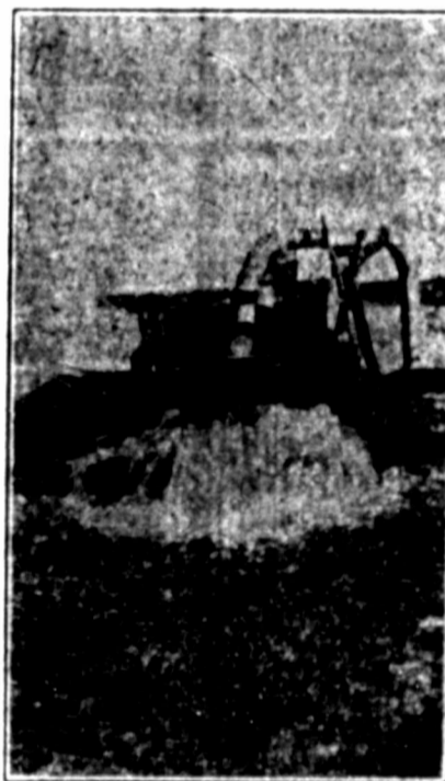
Irrigation Has Come! It includes 10,000 Acres and Costs $350,000.00