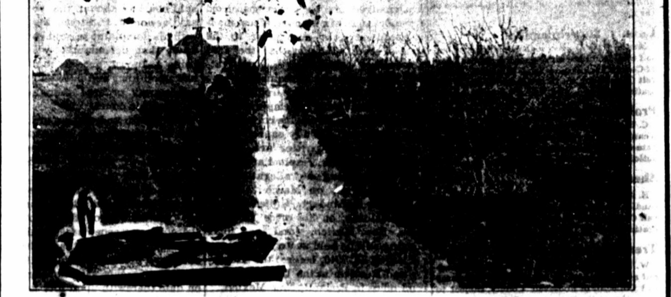
Irrigating a 30 Acre Orchard Adjoining Town of Portales WELCOMES COMING OF IRRIGATION