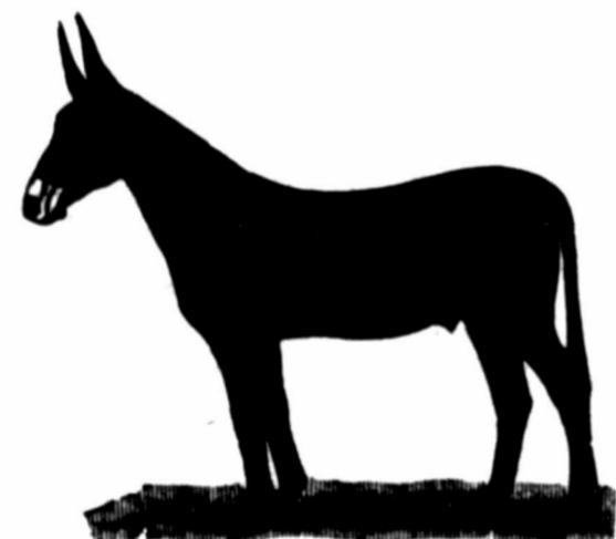
KERMET , black Percheron, sired by Chevalier No. 46774, imported in 1897; dam sire, Majellan No. 10442, imported in 1885.

I will stand the following animals this season at my place, 5 1/2 miles southeast of Portales, each day of the week except Saturday, and on Saturday at Jones & Servis' barn in Portales: