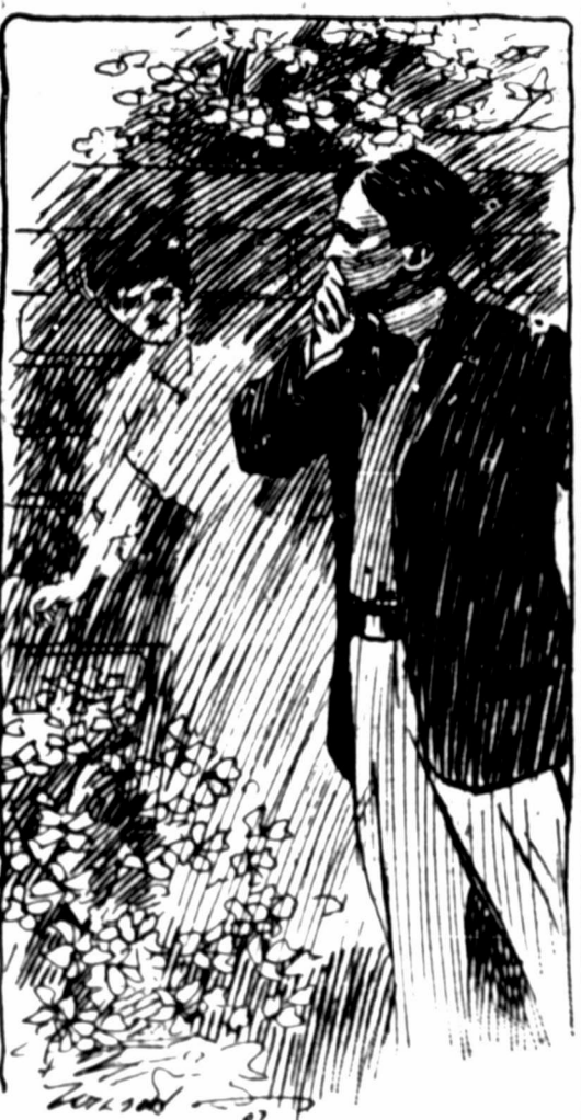
A Dim, Half-Shadowy Blur of White.

Beneath the high wall in his garden, the Poet sat dreaming. He dreamed with his eyes upon a tiny, worn bit of paper that he held with protecting care in the warm hollow of his palm. But now and again as the sweet scents and sounds and happy twitterings of the summer twilight came to him, he looked up smiling with heart and eyes keenly alert and responsive, as if the way of poets when Nature calls to them. As the shadows in the garden deepened, however, so that the tiny square of white upon his palm was fast becoming a gray blur in the darkness, the Poet's eyes clung more lingeringly upon it. He bent over till the paper was within a few inches of his face, his lips