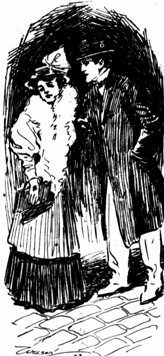
"I Have Something to Say," He Went on, Rapidly.

From the night he had taken some friends to the theater to see the fiftieth performance of his new play, his love for Helen Marley had slowly died. Other nights he had gone and came away heart whole. This particular night he discovered a new girl in the cast. A girl with a babyish face and eyes of gray that smiled back into his own. He looked for her name on the programme and found Amy Merton. Some changes in the piece threw them together at rehearsal. There was something in the half-childish, half-womanly way she treated him that fascinated, and it wasn't long until he realized that his feelings towards his betrothed