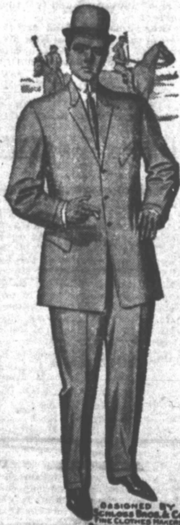
All Wear Schloss Make