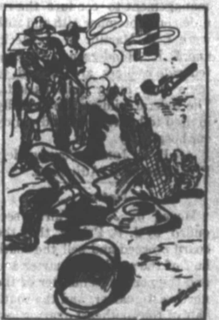
"The Hell You Would!" Cried Du Sang.