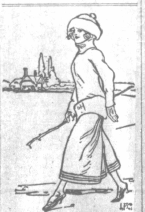
And is Fond of Walking to Keep Herself in Good Health.

the clerk meekly. "Why, every time you get a letter addressed to anybody with a name you can't read you send it up to me. Now