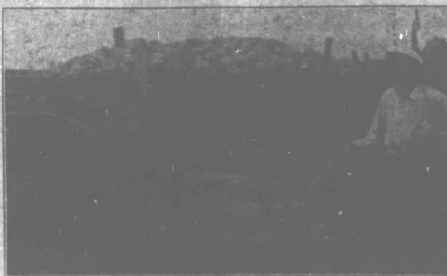
Load of Onions Raised by James Ryther, Portales.

Through the purchase of a number of tracts of land by a number of men living in the same town, it will be an easy matter to arrange to have this land cultivated at a low cost.