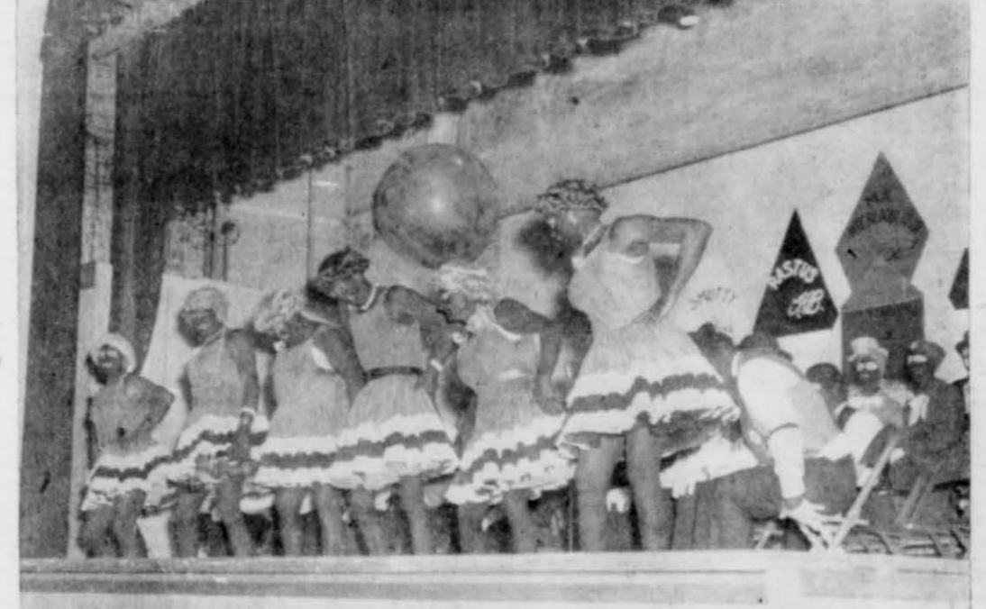
MINSTREL CAPERS —More than $350 for Sunnyside tornado relief came into the disaster fund due to the Tuesday evening performance of a minstrel show by the Springlake Lions Club at the High School auditorium. About 250 persons braved the rainy night to see the show. Above is a group of "dancing girls" putting on a comedy dance routine.