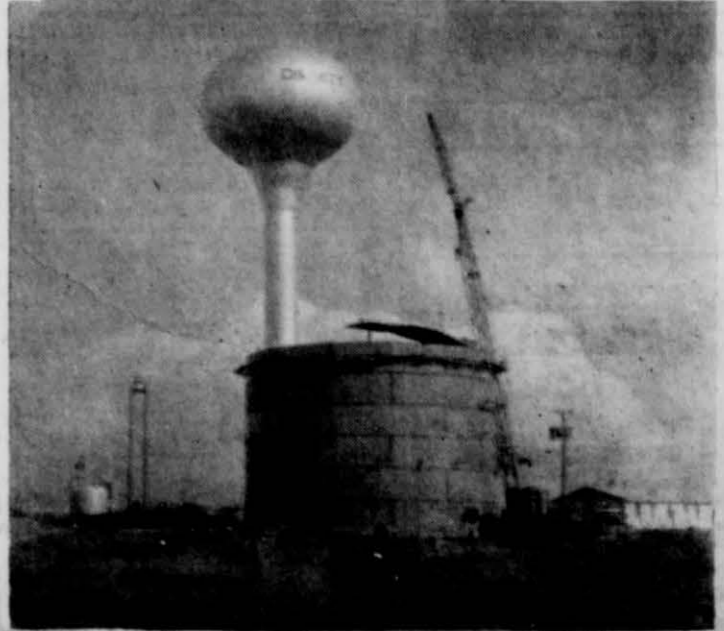
TAKING SHAPE —A new feature of the Dimmitt skyline will be this one-half million gallon water ground reservoir being constructed in the west part of town near the water tower. Builders are Goblett Brothers Steel Company of Fort Worth and the cost is $19,250 for the steel work. The new storage tank was approved in a bond election last year and will guarantee the city an adequate water supply even during peak summer periods.

Total commitments to date for disaster relief to the victims of the tornado now stand at $5086.