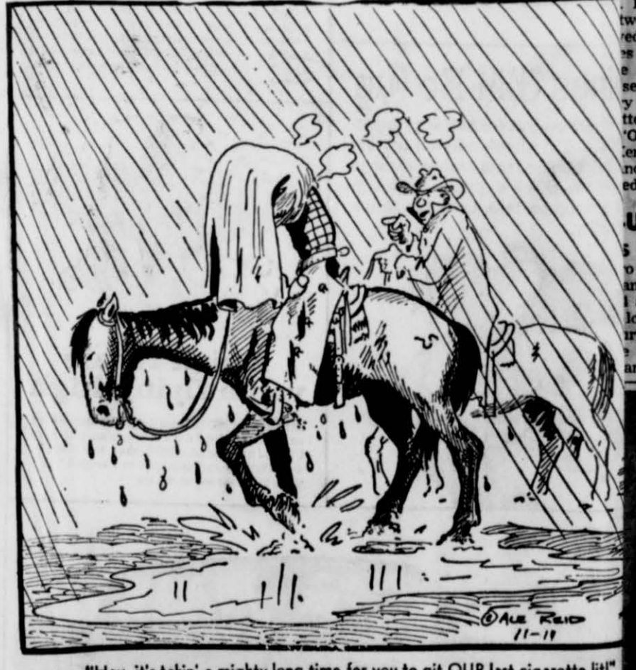
"Hey, it's takin' a mighty long time for you to git OUR last cigarette lit!"