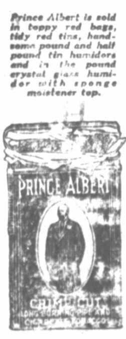
Prince Albert is sold in tippy red bags, they red tips, hand-same pound and half pound tin varieties and in the pound crystal glass humidor with sponge moisture top. Copyright 1921 by E. J. Reynolds Tobacco Co. Winston-Salem, N. C.

You'll enjoy the sport of rolling 'em with P. A.!