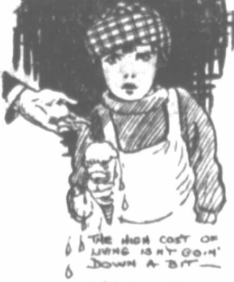
THE JOB COST OF LEAVE IS AT OOH! DOWN A BIT!