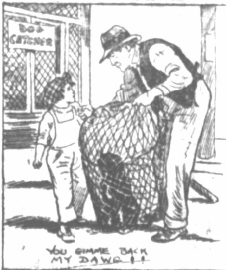
YOU SHOVE BACK MY DAWG!

You know the book. You've laughed yourself hoarse at Jackie Coogan in "The Kid." Irvin S. Cobb has given you more grins than any man living. So get ready for something unparalleled in "Peck's Bad Boy." Five Reels of furious fun.