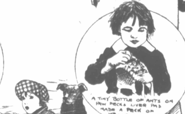
A TINY BOTTLE OF ANTS ON NEW PECK'S LIVES THIS MADE A PECK OF TROUBLE!