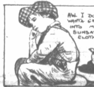
AND I DON'T WANT GET INTO MY SUNDAY CLOTHES