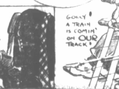
GOLLY! A TRAIN IS COMIN' ON OUR TRACK!