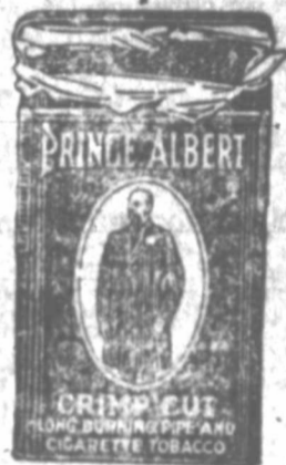
Prince Albert is sold in tippy red bags, tidy red tins, handsome papers, and half pound tin humidors and in the ground crystal glass humidors with sponge moisture top.

Copyright 1921 by R. J. Reynolds Tobacco Co. Winston-Salem, N. C.