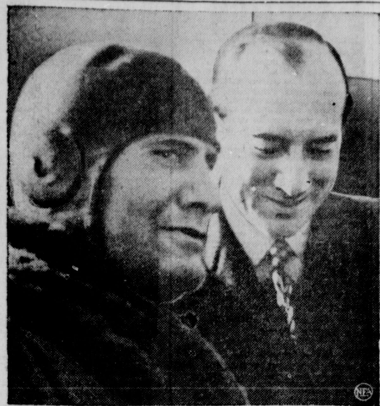
A bustling host to Poland's foreign minister, Col. Joseph Beck, right, was Premier Musolini of Italy, shown in one of his rare grinning moments as he guided the Polish official through Italy's "City of the Air," Guidonia. Shortly after this picture was taken Beck rushed home to assist in the Polish-Lithuanian crisis. Musolini had Italian pilots demonstrate the latest model planes for his visitor.