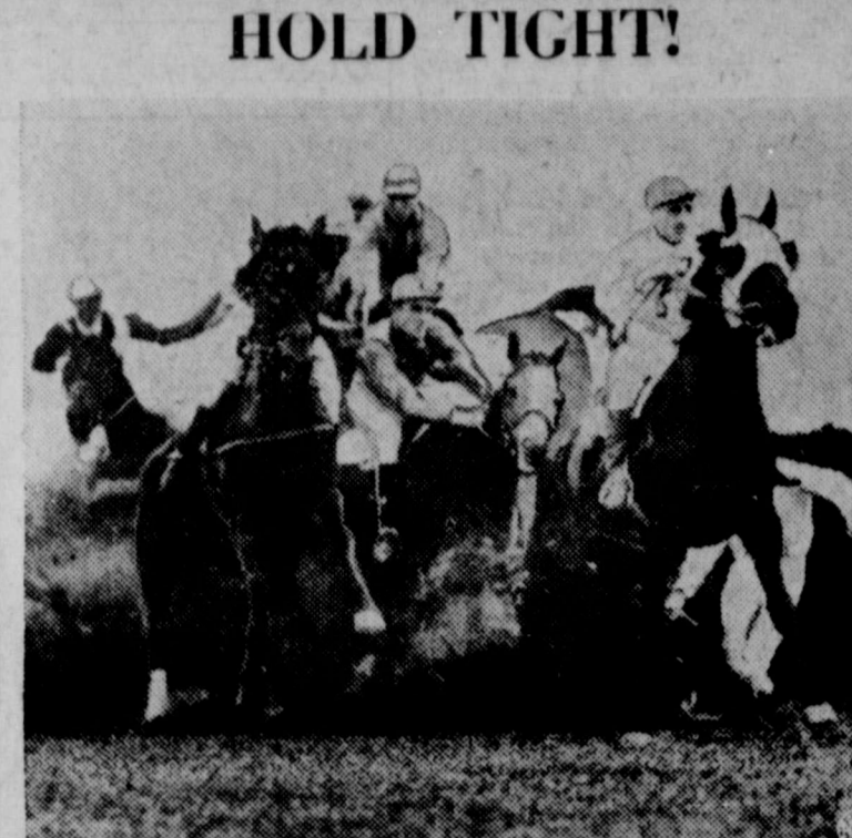
Plunging earthward in a cloud of dust and swarming hoofs, these jockeys received none too gentle treatment when they took a jump in the fourth race of the Sandhill Steeplechase at Pinenurst, N. C. The rider at the extreme right already is on the ground; the one at the extreme left is about to go, while Jockey J. Hall, top center, was the most unfortunate of all, winding up in the hospital with a fractured skull.