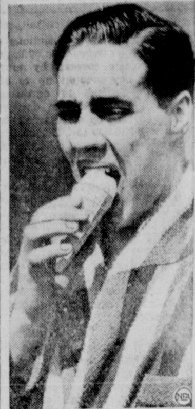
Off the baseball diamond, young Bob Feller is just a typical American boy after all. The Cleveland Indians' star pitcher is shown taking a workout on an ice cream cone at the Tribe's training base in New Orleans.

by contact with such objects, so far as medical science now knows, is a greater danger than trans-