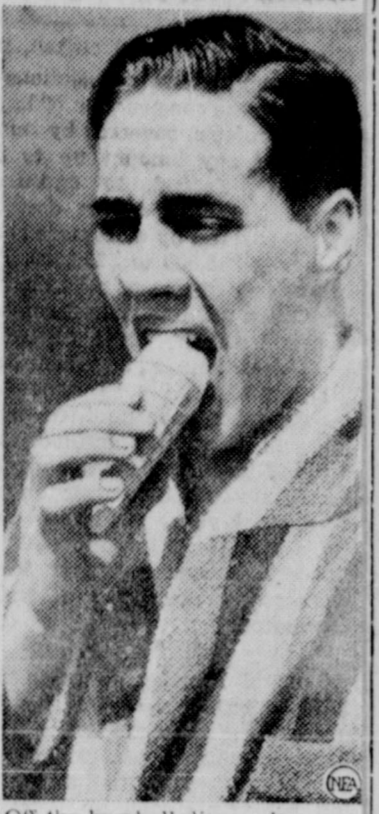
Off the baseball diamond, young Bob Feller is just a typical American boy after all. The Cleveland Indians' star pitcher is shown taking a workout on an ice cream cone at the Tribe's training base in New Orleans.

Make Mine Vanilla The new lamp is in the particular wave length which kills microbes by virtually causing them to explode. The wave lengths that injure the eyes are in the zone of ultraviolet that causes tan. There is only a slight overlap between the "death rays" and tan-making light; the is, there are not many of the tanning rays in the microbe lamp. But in what zone the skin roughening effects noted at the Bell laboratories may exist is not yet known. Physicians have observed that over-exposure to the ultraviolet rays of the sun for many years has had effects on the skin. There also is medical evidence that some of the ultraviolet rays possess healing effects on human and animal tissues. New Meter Guides Science It has not been possible until recently for scientists to know precisely which ultraviolet wave lengths they were dealing with. Doctors Rentschler and James have a light meter which makes this kind of selection possible. The light meter enabled them to build a lamp which, it appears, excludes most of the "bad" rays, and possibly those which roughen human skin after years of exposure. Besides giving human beings purer air to live in, the lamp sterilizes food and drink, eating utensils and any object on whose surface germs can live. The transfer of disease germs by contact with such objects, as far as medical science now knows is a greater danger than tran