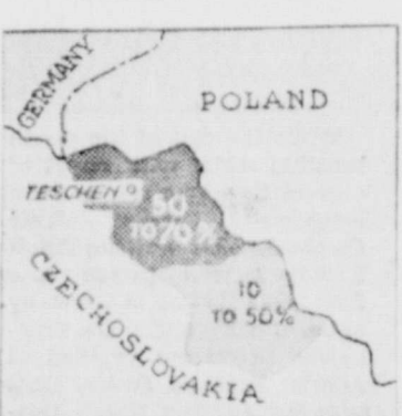
The Poles have passed the platter and the Czechs have sliced away another part of their fast-diminishing little land, agreeing to withdraw troops from the areas shaded in the map above.

The 12 banks for co-operatives of the farm credit administration report there are 3,270,000 members in farmers' co-operative associations in the United States.