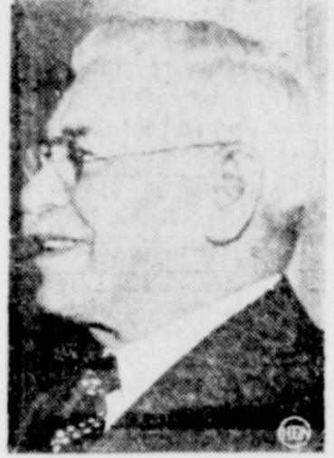
In line for chairmanship of the important House Rules Committee is 72-year-old Adolph J. Sabath, above, Illinois congressman who has represented his district 33 years.

American cooking," he continued. "Americanize the menu; never use foreign terms if you can avoid it; make your dishes American."