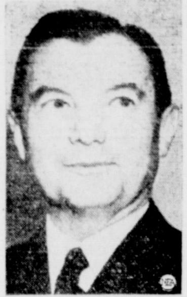
Reported successor to Attorney General Homer S. Cummings, whose retirement is set for January, is youthful Solicitor General Robert H. Jackson, above.