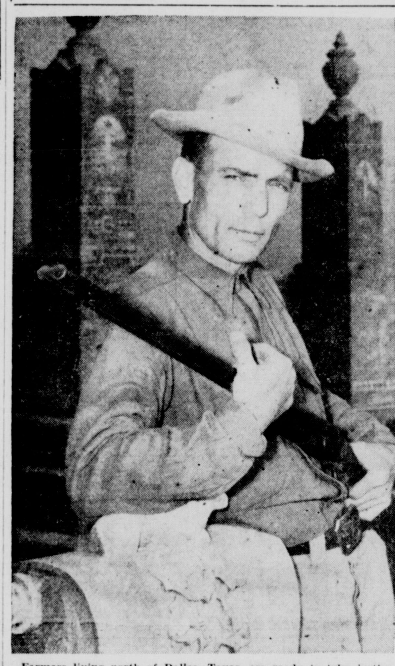
is not stopped. (NEA Telephoto).