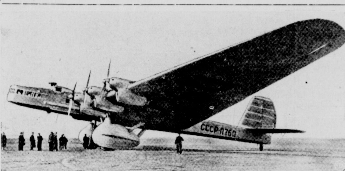
Men are dwarfed by this huge air liner, only six-motored plane in the world, which recently went into passenger service out of Moscow. The 60-passenger ship has five cabins in the fuselage and four sleeping compartments in the wings. It can cruise 1900 miles at about 130 m. p. h.