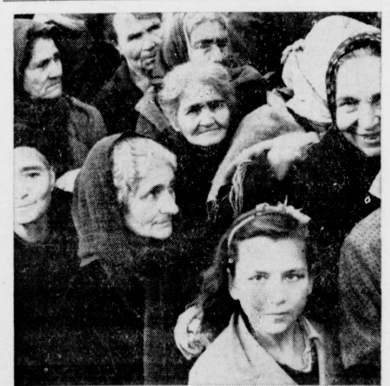
BREADLINE DELUXE-While these Greek citizens line up for food from kitchen run by British troops, pipers march up and down entertaining war refugees. Kitchens were established distinct from those run by military liaison and UNRRA to help speed food distribution.