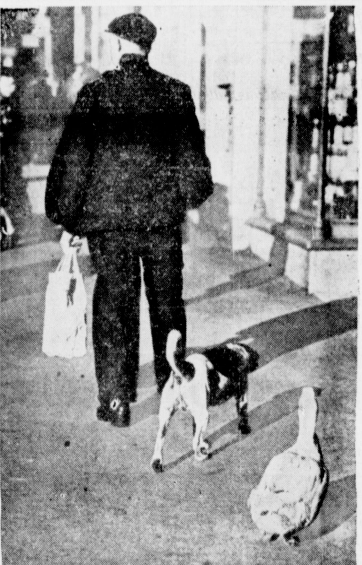
TAG-A-LONGS—Drake and pooch follow master on shopping tour down High Street in London. Bird was originally intended for Christmas dinner but family lost appetite when he became close pal of terrier. Animals are inseparable and frequently take long strolls together.