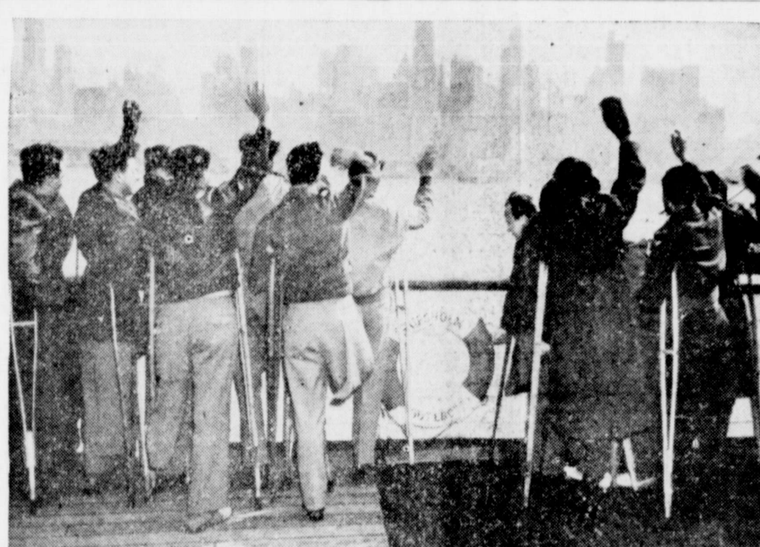
THE LAND OF THE FREE—American soldiers repatriated from Germany wave joyfully as they get first glimpse of New York skyline. The men, all with crutches, are aboard Swedish exchange liner Gripsholm headed for Jersey City pier. Of the 1,206 repatriates, 463 are exchanged American prisoners, 632 are civilians, 42 are merchant seamen and 78 are Canadians.

Some 25 or 30 members of John William Butts Post, American Legion, assembled in Laguna Hotel roof garden Monday night for a business and social session. Attendance was not as large as expected, but it was a thoroughly pleasant affair and a repeat meeting of the same nature will be held some time in March, it is said. Coffee and doughnuts were served.