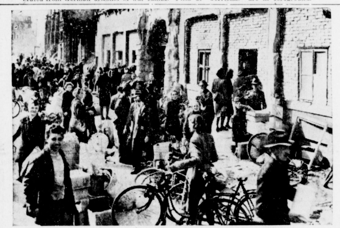
THE MORNING AFTER-War has passed over Hannover and citizens have emerged from their hiding places. They are salvaging whatever goods they can find from damaged homes. Until American cuthorities enforced order, there was much looting. Here people use bicycles for traveling,