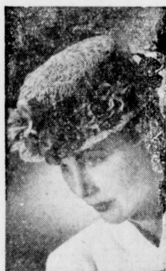
PLASTIC HAT — Milliners and chemists collaborated to produce hat of new plastic plexon. Yarn made in 120 colors is immune to powder, moisture and is easily cleaned with damp cloth. Garden flowers trim brim of dainty lacey straw.