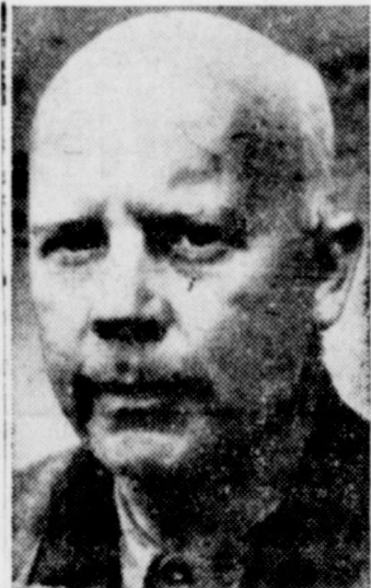
PARIS BUTCHER SS Gen. Karl Albrecht Oberg is shown after capture by U. S. 7th Army. He admitted identity but claimed superior officer Field Marshal Stulpnagel ordered mass executions which took place in Paris.