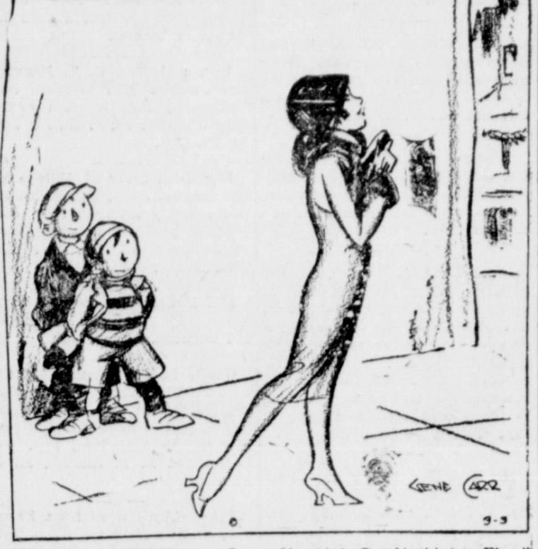
"Aw, She Ain't a Flapper, 'Cause She Ain't Got Nothin' to Flap!"