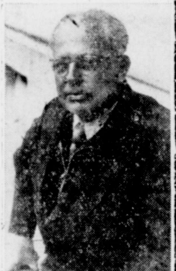
PERSONAL photographer to Hitler, Heinrich Hoffman is giving "thumbs up" sign for some unexplainable reason. After capture by U. S. 7th Army, Hoffman claimed to be only business friend of der fuhrer. He also stated that Goering disliked him and refused him permission to take pictures. During early days of Nazism, Hoffman fed and clothed Hitler.